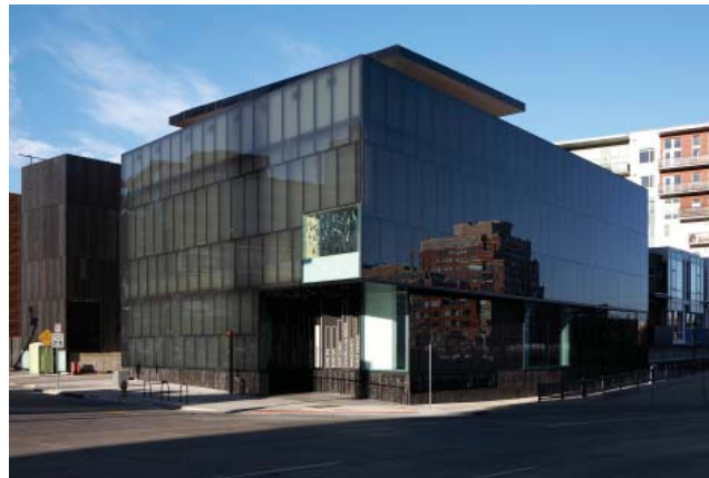
Museum of Contemporary Art, Denver