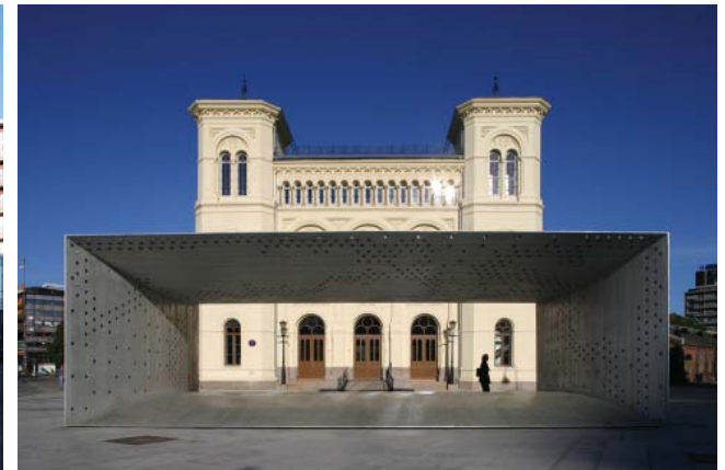
Nobel Peace Centre, Oslo