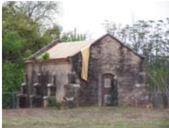
Building 2157 at Fort Sam Houston