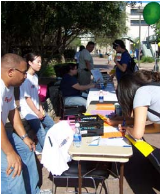
Students check out the resource tables during the NLAAD event held on the UC Paseo.

Every year October 15 th marks the recognition of National Latino AIDS Awareness Day (NLAAD). This year is the seventh annual commemoration of the National Latino AIDS Awareness Day at UTSA in recognition of the Hispanic Heritage Month.