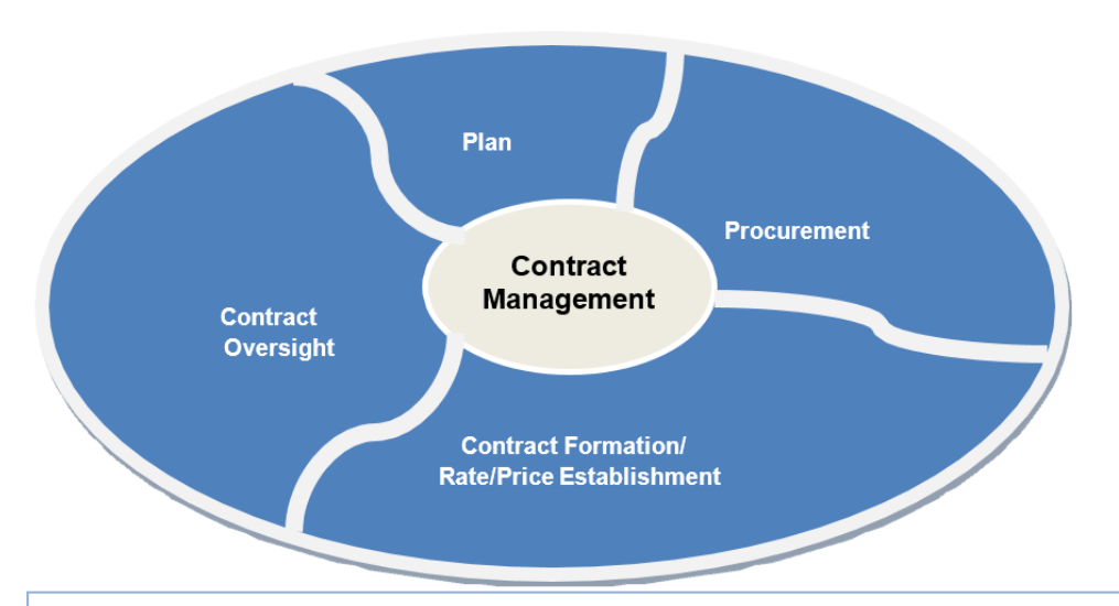
Plan – Identify contracting objectives and contracting strategy.

During the planning phase each of the following elements of contract management should be considered: