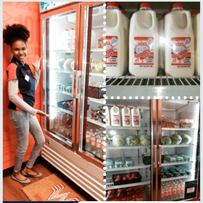
Commercial fridges for the UTSA roadrunner Pantry