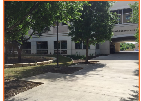
The Graduate School and Research Building