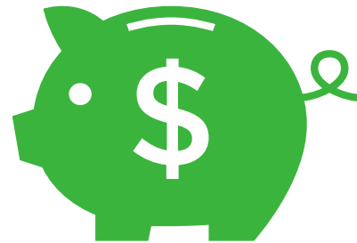
Delta Dental Premier ®