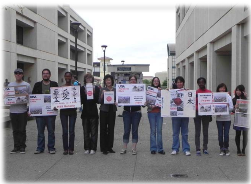
Donation drive at UTSA to help with the Japan relief