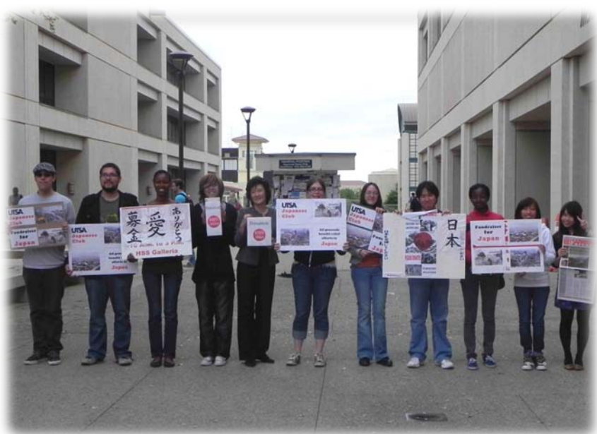
Donation drive at UTSA to help with the Japan relief