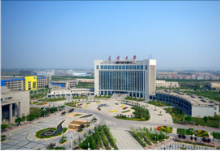
Chang'an University located in Xi'an China