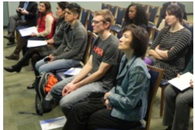
The audience listening to the presentation

The UTSA East Asia Institute's mission is to promote appreciation and understanding of East Asian societies and cultures both on campus and in the community through research, outreach, networking, education, student/faculty exchange, and business development and cooperation. The East Asia Institute organizes seminars, workshops, lectures, conferences, film festivals, visual art exhibitions as well as bringing in performing art groups from China, Japan, Korea, and other Asian nations. It also encourages faculty research collaborations both within UTSA and with participating East Asian university researchers. All events are free and open to the public.