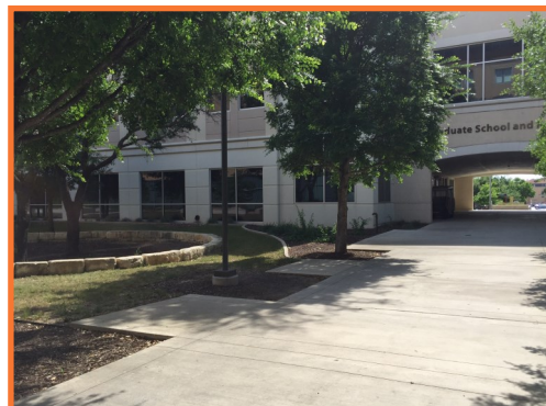
The Graduate School and Research Building