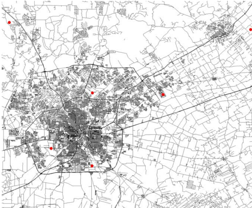
Figure 1 - Location of Rain Gauge Sites